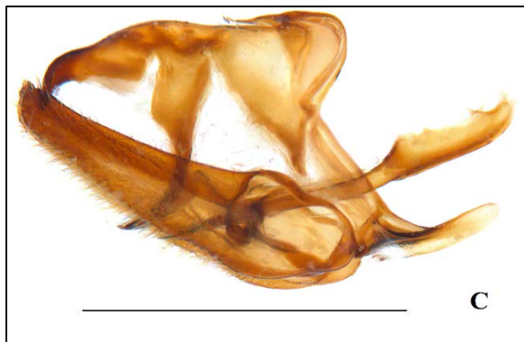
Figure 13 – Genitalia of Cymothoe species: A C. baylissi sp. nov.; B C. teita ; C C. alcimeda . Scale bar = 2 mm