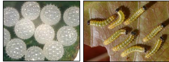
Figure 14 – C. baylissi sp. nov. ova (left) and 1 st instar larvae (right)

Early stages: Eggs were found on Rawsonia lucida Harv. & Sond. (Achariaceae), and on Mt Mabu females were observed ovipositing on this tree. Larvae were raised to the adult stage on all three mountains (Congdon et al. , 2010). Eggs are laid in batches, and on emergence, the young larvae eat the egg shells (Fig. 14), and go on to eat any infertile eggs in the batch, a behaviour not previously observed by the authors. Larvae are gregarious in the early instars (Fig. 15), becoming solitary in the third instar (Fig. 16), after which they rest on the upper surface of a leaf of the host plant. The fully mature larva (Figs 17–18) moves to the underside of a leaf to pupate (Figs 19–20).