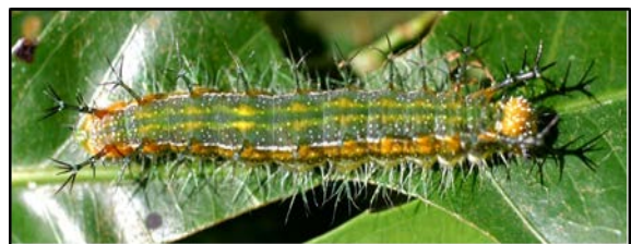
Figure 18 – Final instar larva dorsal view