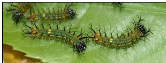
Figure 16 – 3 rd instar larvae