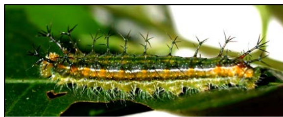
Figure 17 – Final instar larva, dorso-lateral view