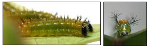
Figure 15 – 2 nd instar larvae (left) and final instar larva head shield (right).